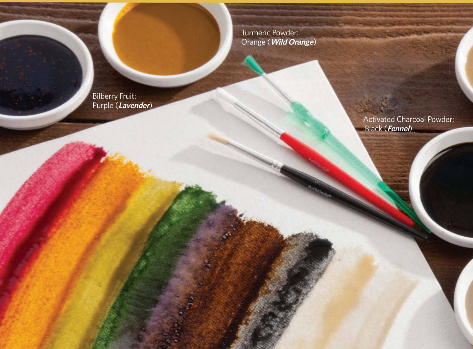
Turmeric Powder: Orange ( Wild Orange )