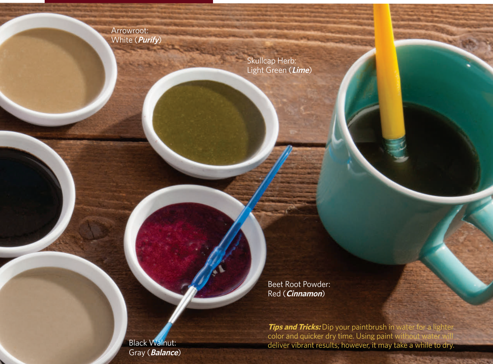
Arrowroot: White ( Purify )

Tip: You can use empty baby food containers, or essential oil bottles to store paint.